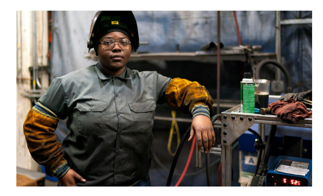
"Graco, Dunwoody teaching students how to program robots to talk to machines." Star Tribune 3.9.19